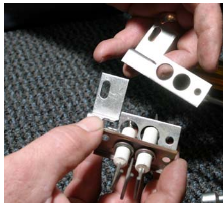
Figure 3: The new bracket is shown behind the existing bracket. Attach it, in the position shown, with a single screw, which secures it to the igniter assembly.