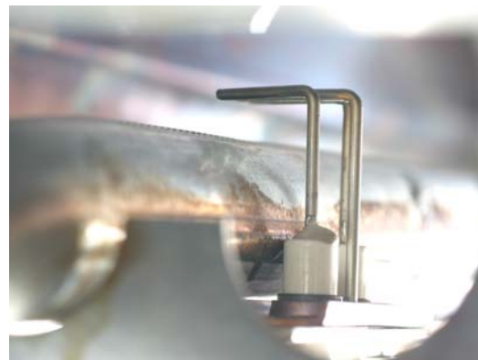
Figure 4: Before the final burner tube is inserted, ensure the igniter elements are positioned, as shown, above the burner tubes.